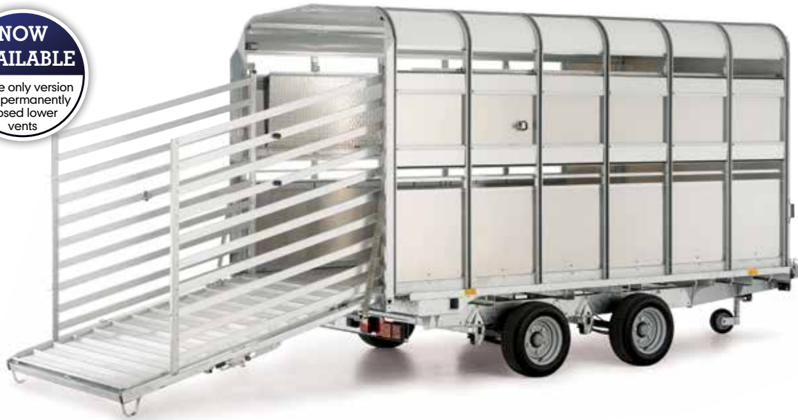
DP120 12' (6' headroom) with optional lower vent rail

NOW AVAILABLE Cattle only version with permanently closed lower vents