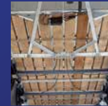
Chassis and Floor

It's the attention to detail of Ifor Williams trailers that makes our products so popular with owners. Just take a look at these standard features.