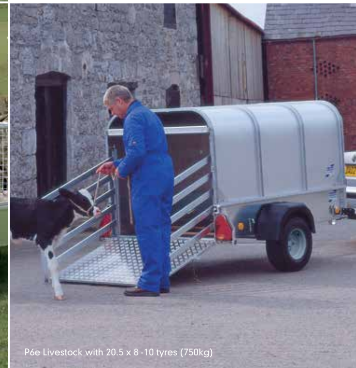
P6e Livestock with 20.5 x 8-10 tyres (750kg)

See page 10 for unladen weights and page 14 for maximum gross weights and tyre options