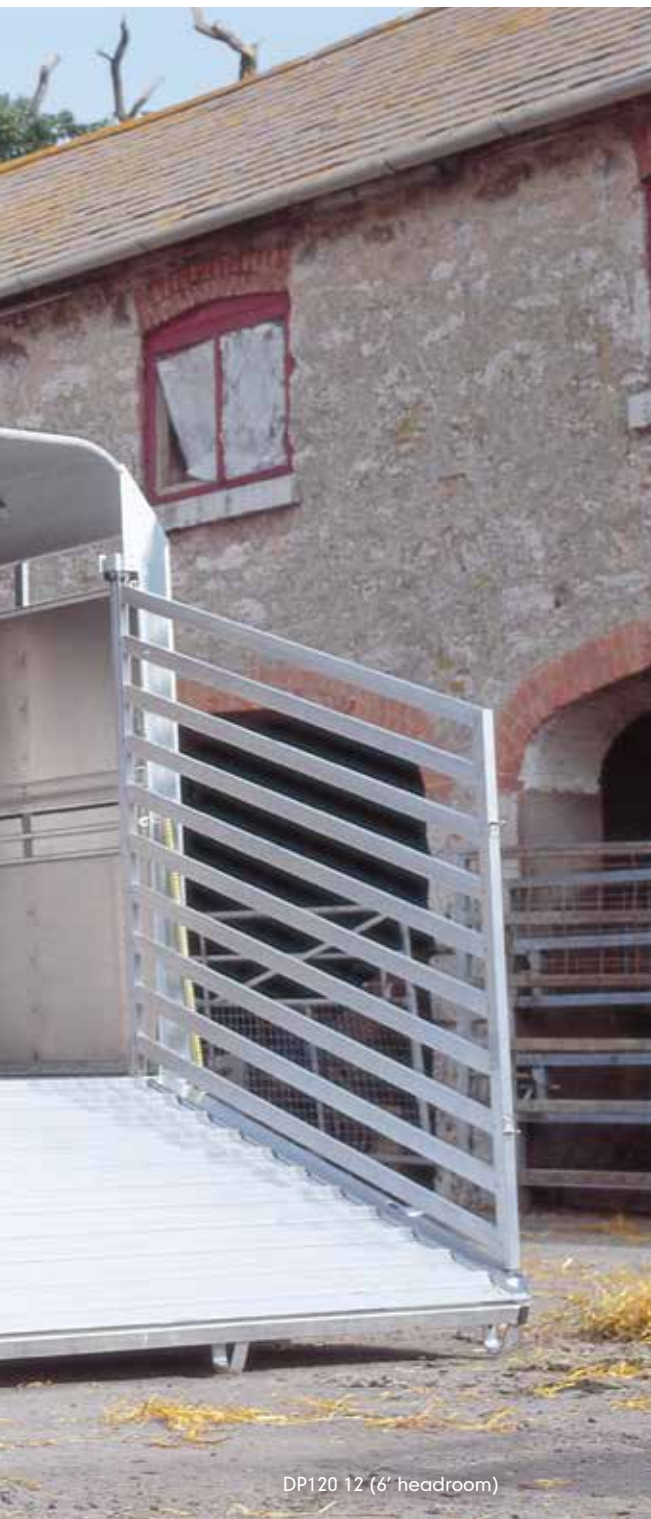
DP120 12 (6' headroom)