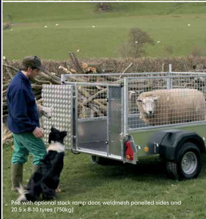
P6e with optional stock ramp door, weldmesh panelled sides and 20.5 x 8-10 tyres (750kg)