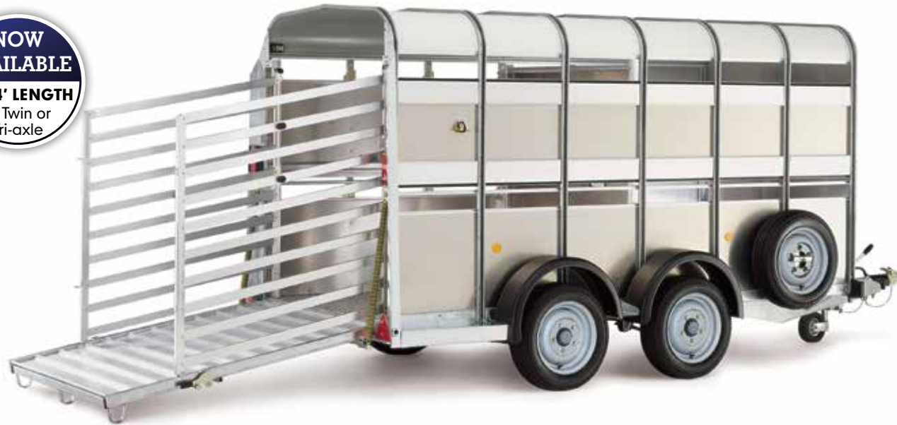
TA5 8' (6' headroom) with optional lower vent rail

NOW AVAILABLE IN 14' LENGTH In Twin or Tri-axle