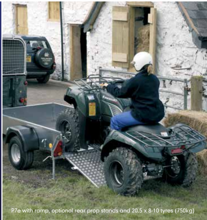
P7e with ramp, optional rear prop stands and 20.5 x 8-10 tyres (750kg)

Other variants of the P6e and P7e are available. Our complete range of P6e and P7e trailers can be found in our unbraked brochure, available from your local distributor.