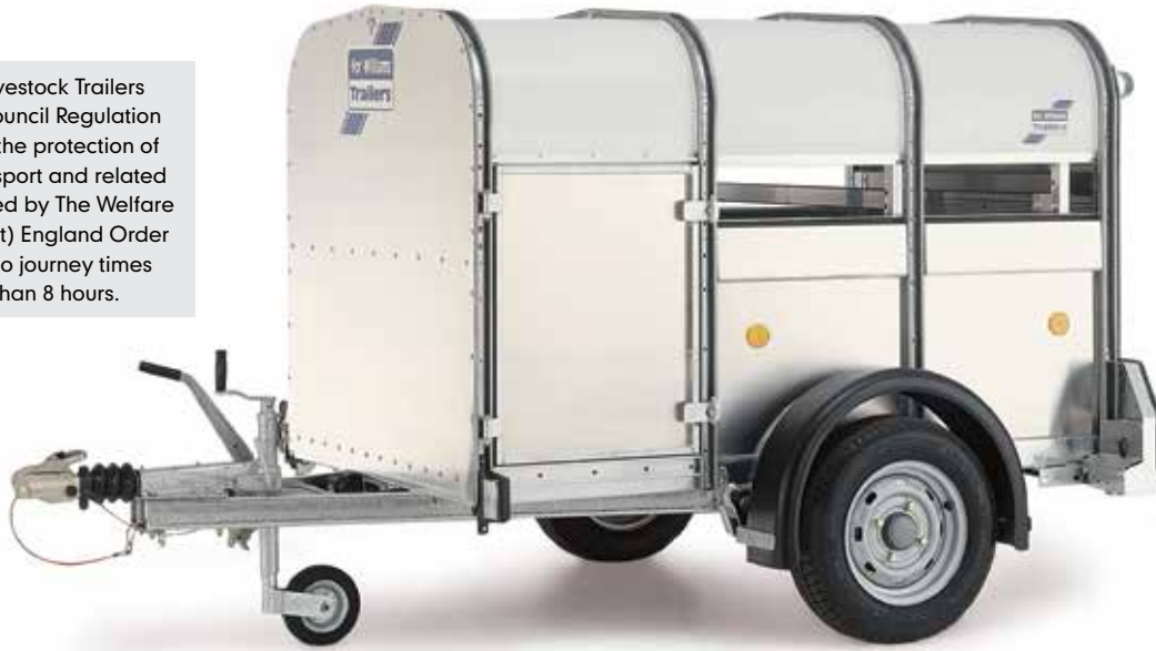
P8g 8' long (4' headroom)

All Ifor Williams Livestock Trailers fully comply with Council Regulation (EC) No. 1/2005 on the protection of animals during transport and related operations as required by The Welfare of Animals (Transport) England Order 2006. This applies to journey times which are less than 8 hours.