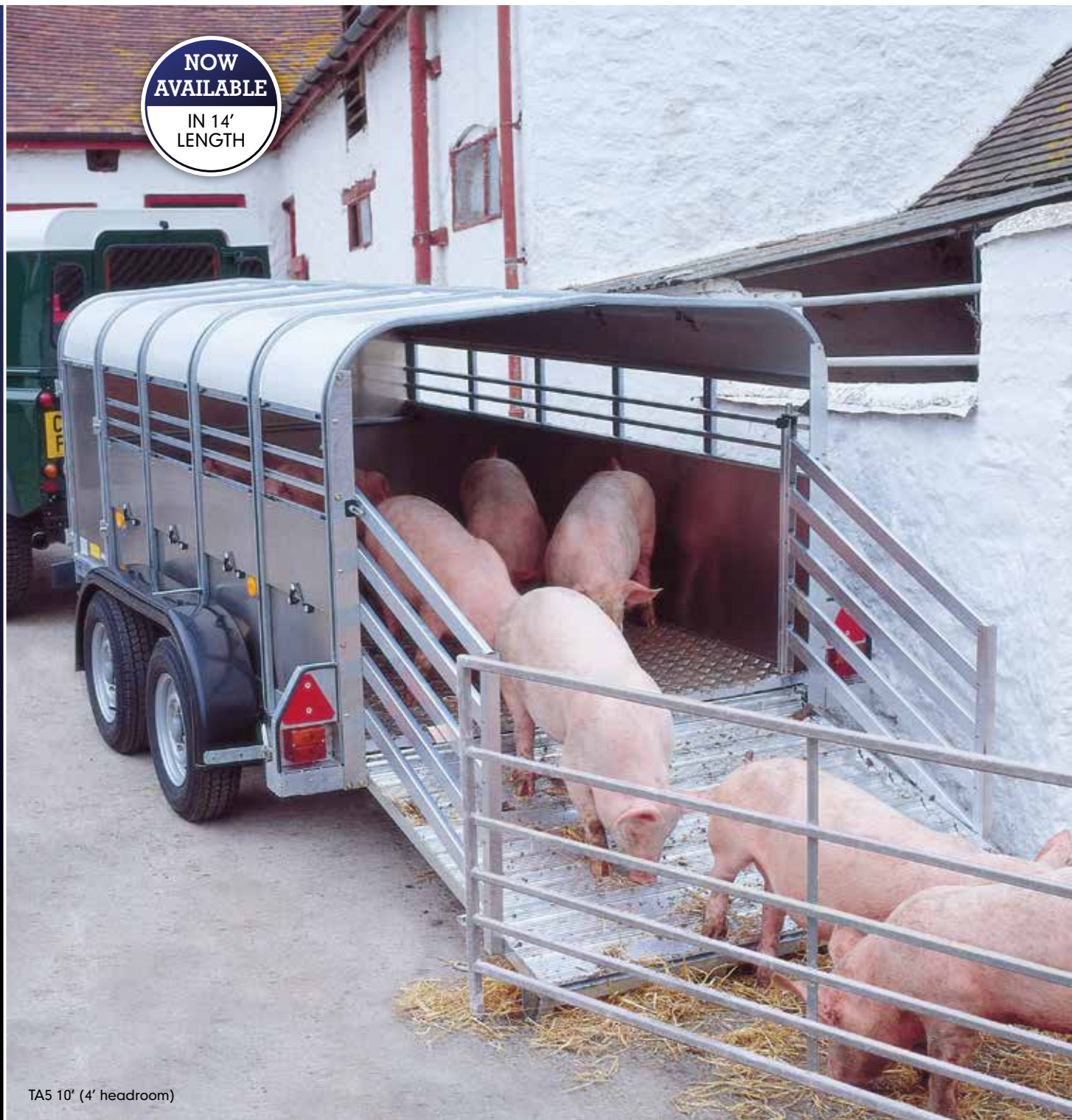
TA5 10' (4' headroom)