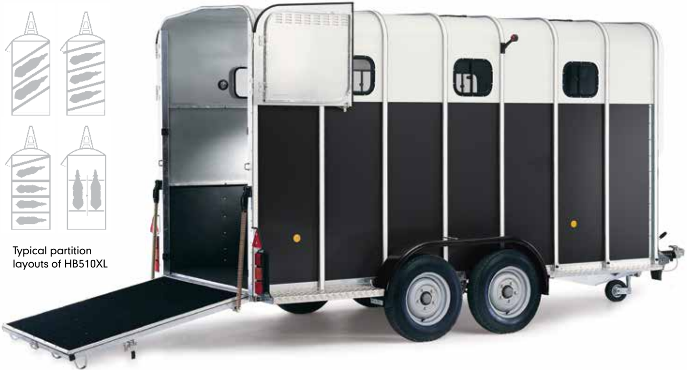
Typical partition layouts of HB510XL