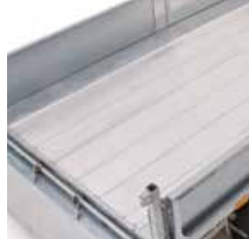
Aluminium Planked Floor