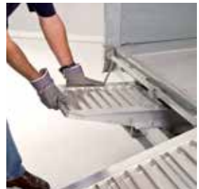
Rear Light Guards Loading Skids

The addition of selected accessories allows you to further enhance your trailer and tailor it to suit your specific needs.