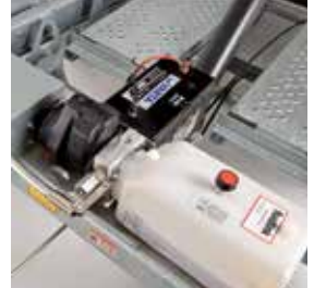
Electric Hydraulic Tip