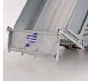
Swing Tailboard Dropsides