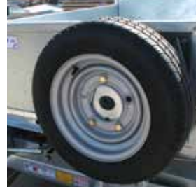
Spare Wheel Beam Axle