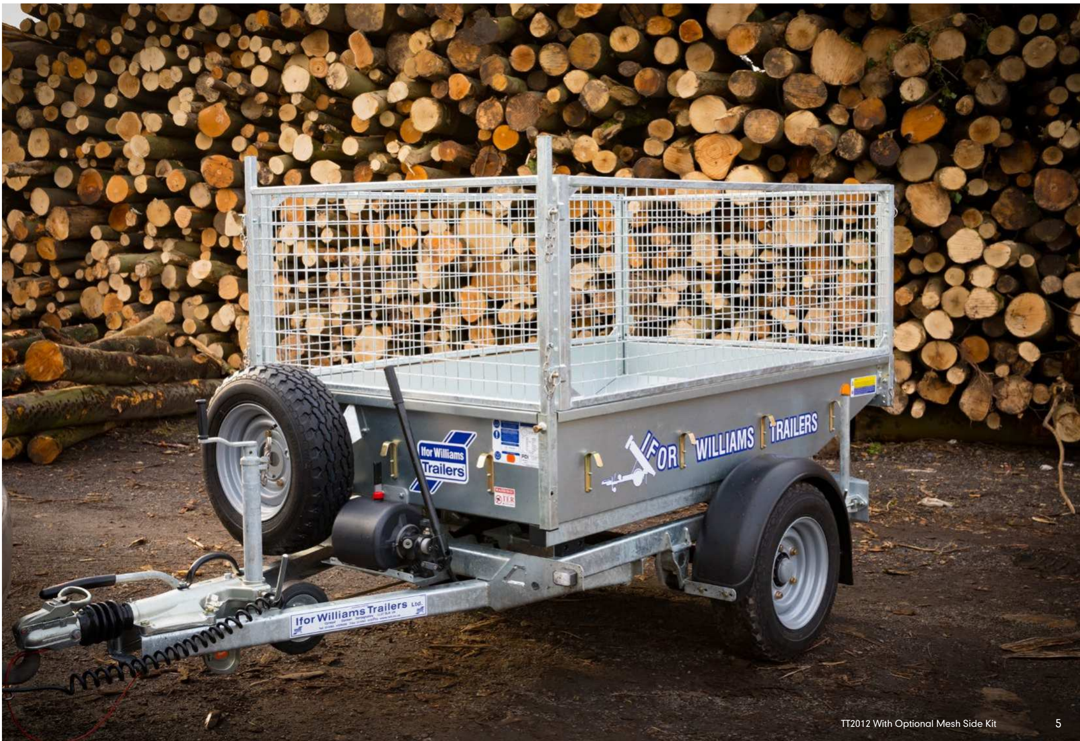
TT2012 With Optional Mesh Side Kit