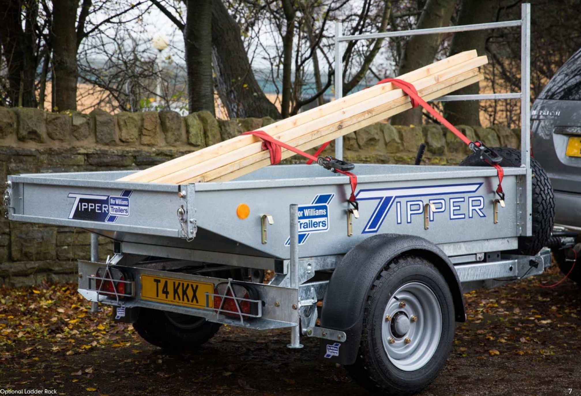
TT2012 With Optional Ladder Rack