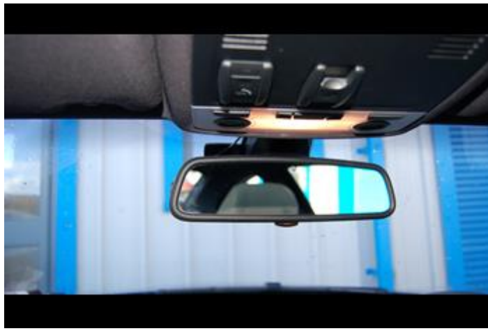
View from behind with the RoadHawk camera hidden behind the rear view mirror.