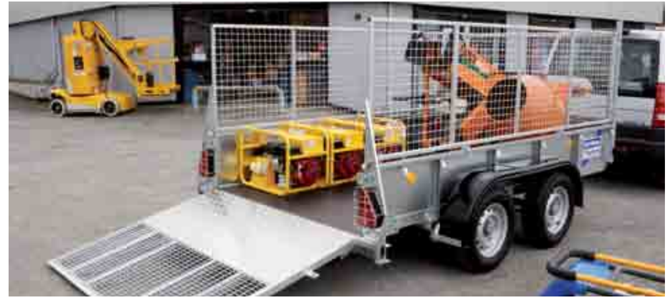
GD105 with mesh sides and ramp