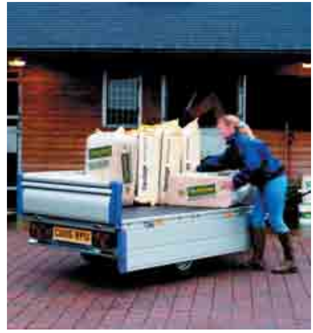
EL101-2012 with optional aluminium dropsides