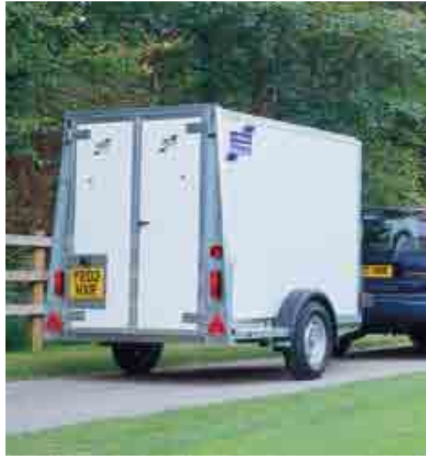
BV84 single axle model

Whatever you need to carry, there's an Ifor Williams Box Van to suit your needs. Take a look at the features and you'll find practicality, durability and reliability built in.