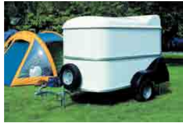
BV64e roller shutter model