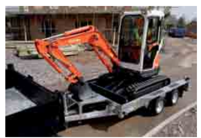
GX106 with skids