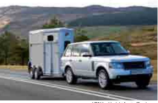
HB511 with right front offload ramp

Being a narrower trailer, the HB403 is easier to tow and produces less wind resistance when towing. The HB403 is ideal for transporting nervous horses that require a wider stall and may prefer to travel alone.