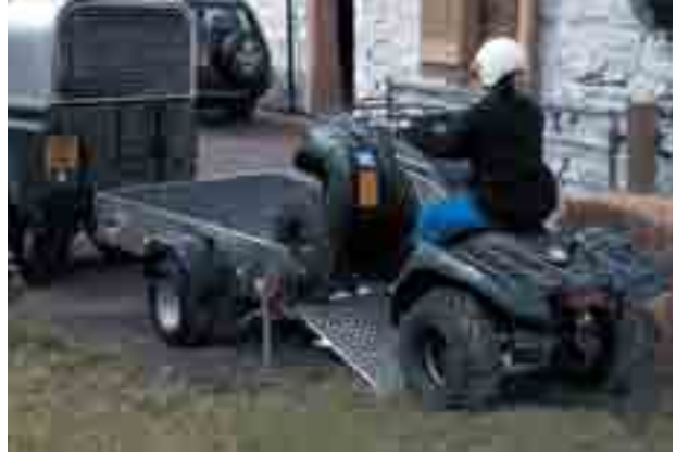
P7e ramp model with optional propstands