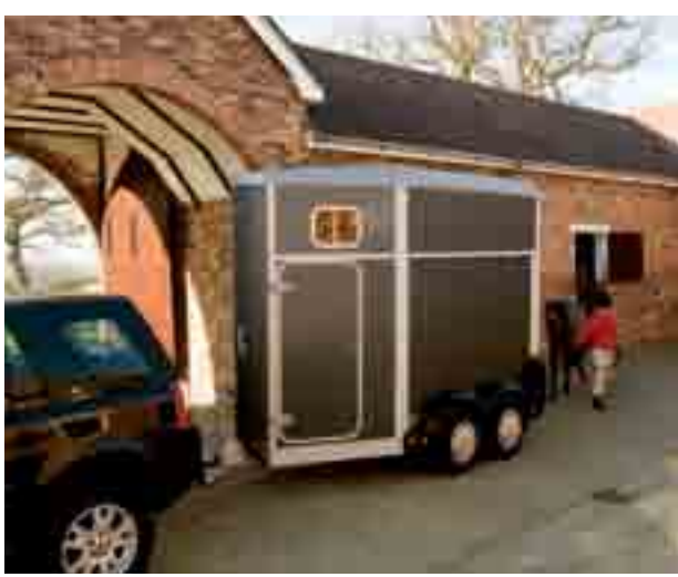
HB403 with right front offland ramp