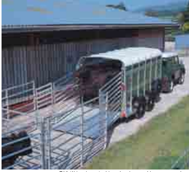
TA5 (6' headroom) with optional ramp side gate extensions