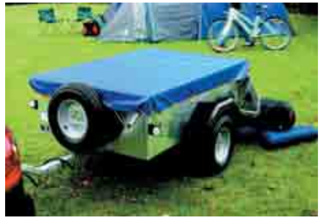
P5 tailboard model with optional tarpaulin cover

Larger, stronger and tougher than trailers typically sold at your local DIY or car parts superstore, the lfor Williams unbraked range are small trailers with big hearts. On the road they can be towed by a family car,<sup>1</sup> off road they can even be towed by a quad bike.<sup>1,2</sup>