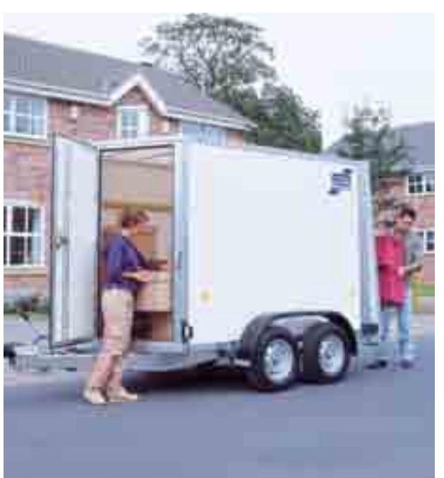
BV85 with roller shutter

The BV6 is available in lengths of 10ft or 12ft, and two headroom options: 6ft and 7ft. All models have a maximum gross weight of 3500kg.