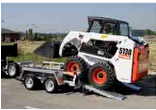
GP106 with skids

GX models and low sided GP models are fitted with a bucket rest as standard as well as integrated ramp & skid supports.