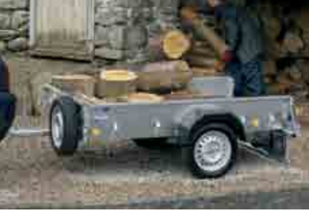
P6e tailboard model

1 Refer to towing vehicle manufacturers handbook for maximum unbraked towing limit. 2 If fitted with optional Quad Bike drawbar.