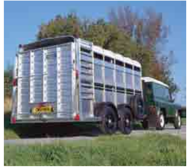
TA510 12' (6' headroom) with optional ramp side gate extensions