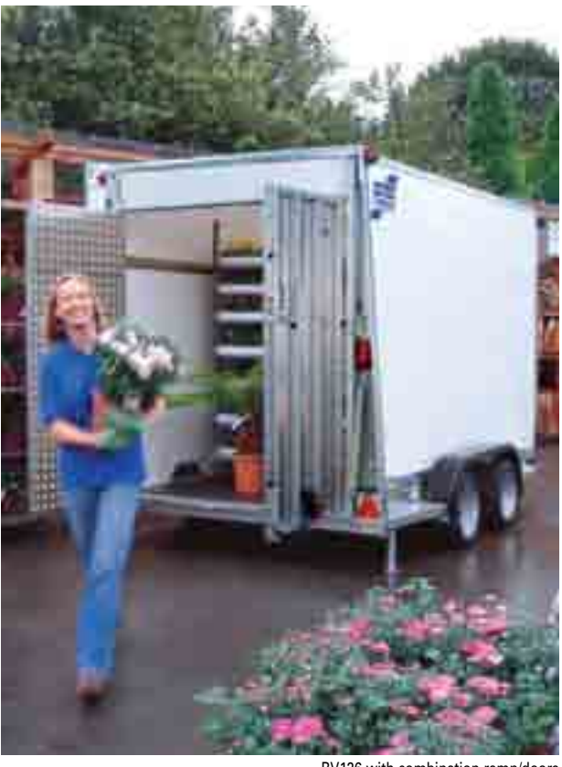
BV126 with combination ramp/doors