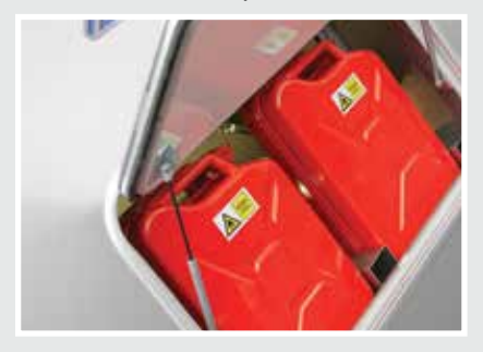
4. Front Wall Access Hatch The front wall access hatch allows for easy access to the front storage cabinet.