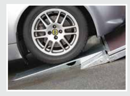
3. Ramp Skid Extenders Pair of ramp skid extenders to aid loading of vehicles with low clearance.