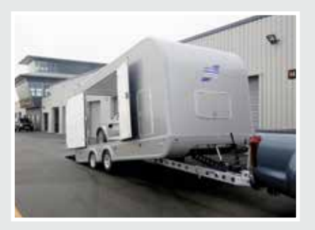
Tilting Drawbar To aid loading vehicles with low ground clearance.