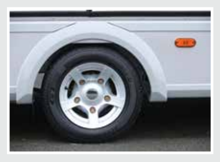
Alloy Wheels Give your trailer the wow factor by adding a set of exclusive alloy wheels.