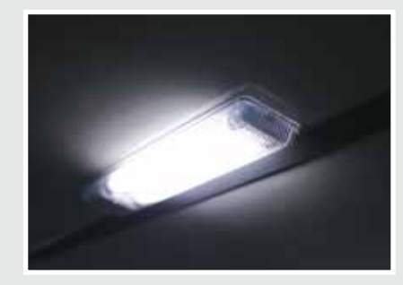
Central front lamp to light up the working area— Powered by towing vehicle or on board battery.